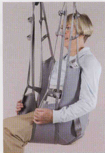
DOMINO AMPUTATION. The special design of the straps provides optimum support and balance. Safety belt as an accessory.