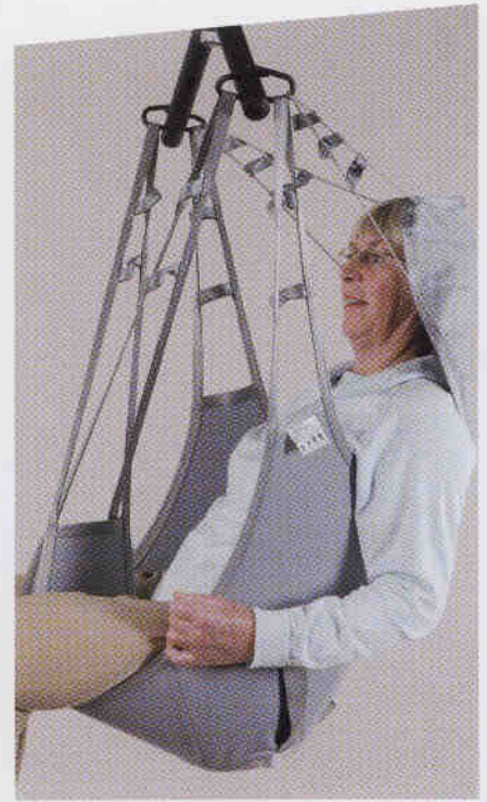
DOMINO COMBI is designed like the Active Sling, but has an extra built-in head support, which is hidden in a pocket in the back of the sling. Safety belt as an accessory.