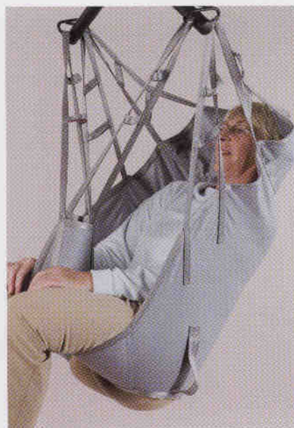
DOMINO CLASSIC. Suitable for persons with little control over their head and body. Suitable for lifting from a lying position. Supports the whole body. Extra foam padding in leg, body and head section – for better comfort.