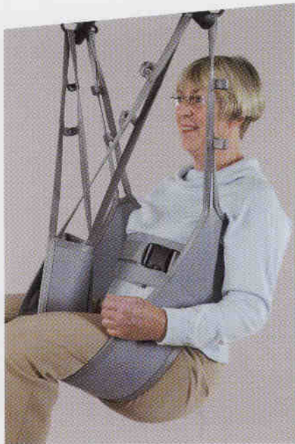
DOMINO HYGIENE is incl. safety belt. Suitable for lifting persons from sitting to sitting position. Suitable for hygiene and bathroom purposes.

Domino Slings are produced using a specially manufactured polyester material, which unites comfort with an incredible strength. The material has an emery finish on the inside. This gives the Sling a cotton-like surface, which is both comfortable for the user and at the same time ensures that the Sling does not slide. The material is fire retardant.