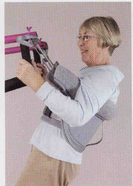
DOMINO THORAX. Only for stand-up hoist. Unique design and padding. Provides optimum support for stand-up lifting. Can also be supplied without padding under the arms.